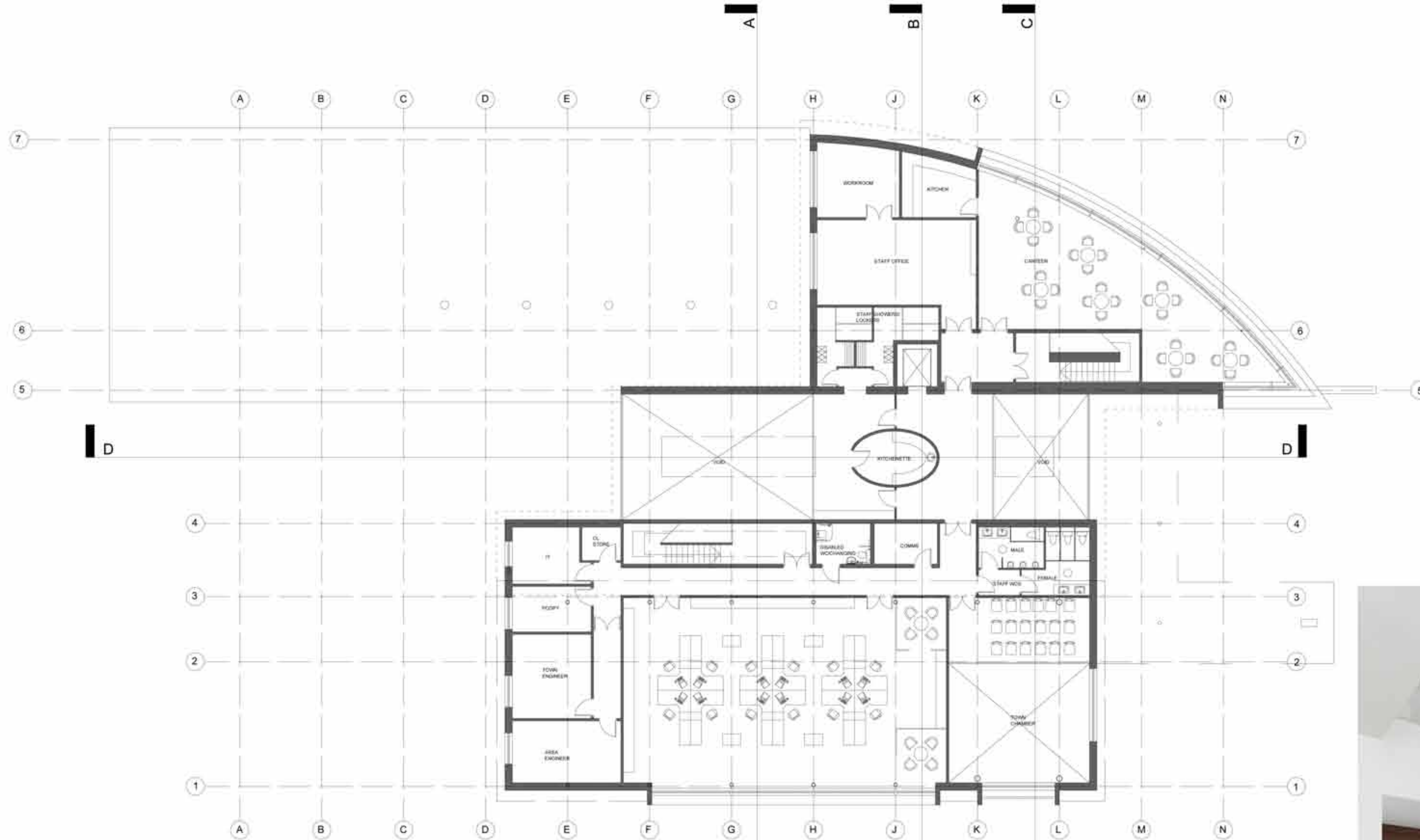
FIRST FLOOR PLAN SCALE 1:150