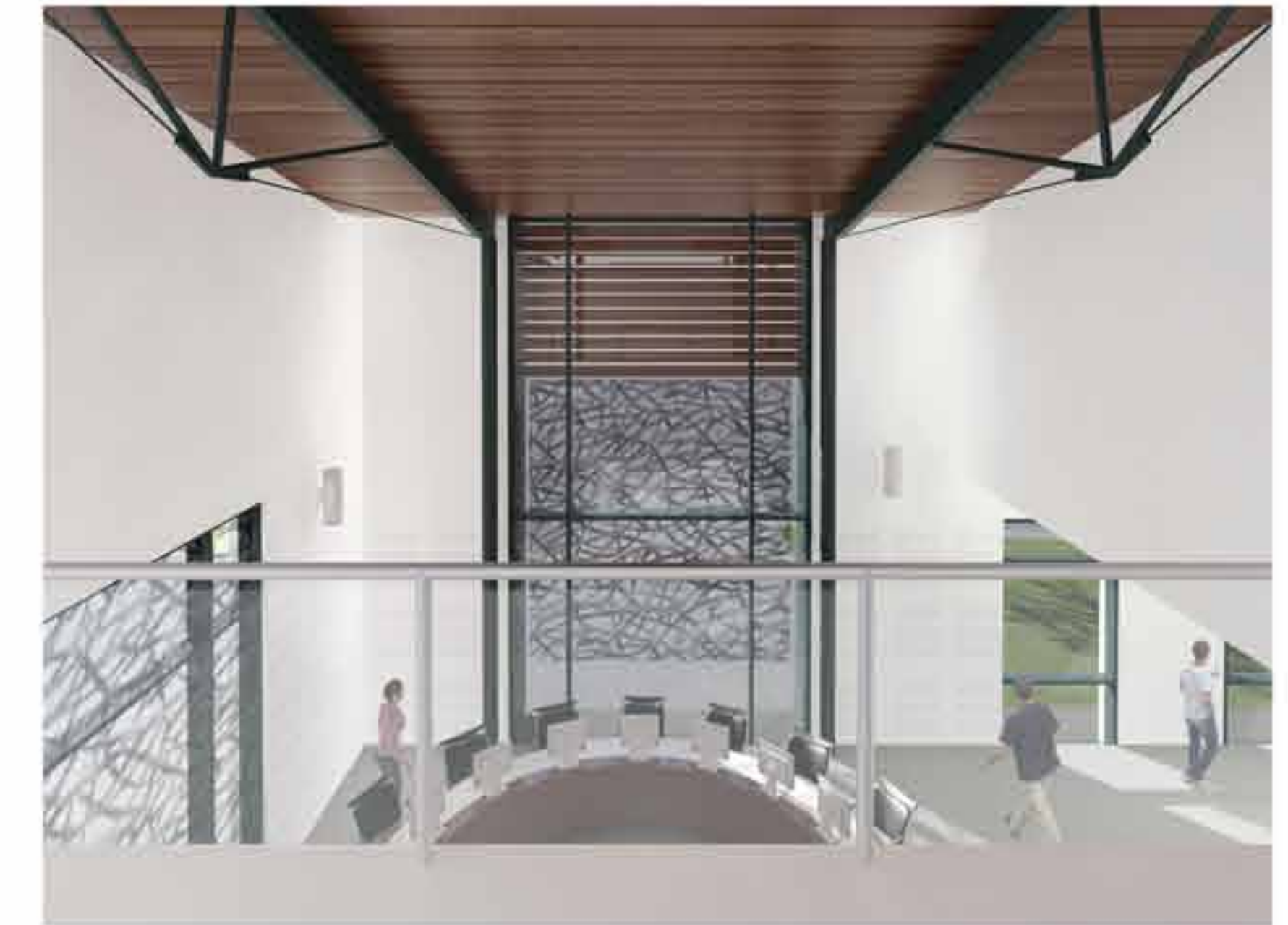
TOWN CHAMBER FROM GALLERY